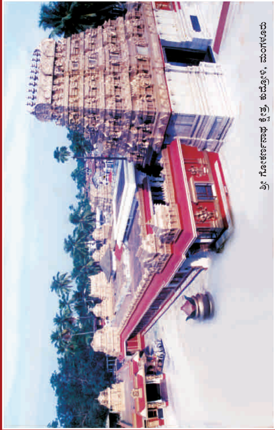
ಶ್ರೀ ಗೋಕರ್ಣನಾಥ ಕ್ಷೇತ್ರ, ಕುದ್ರೋಳಿ, ಮಂಗಳೂರು