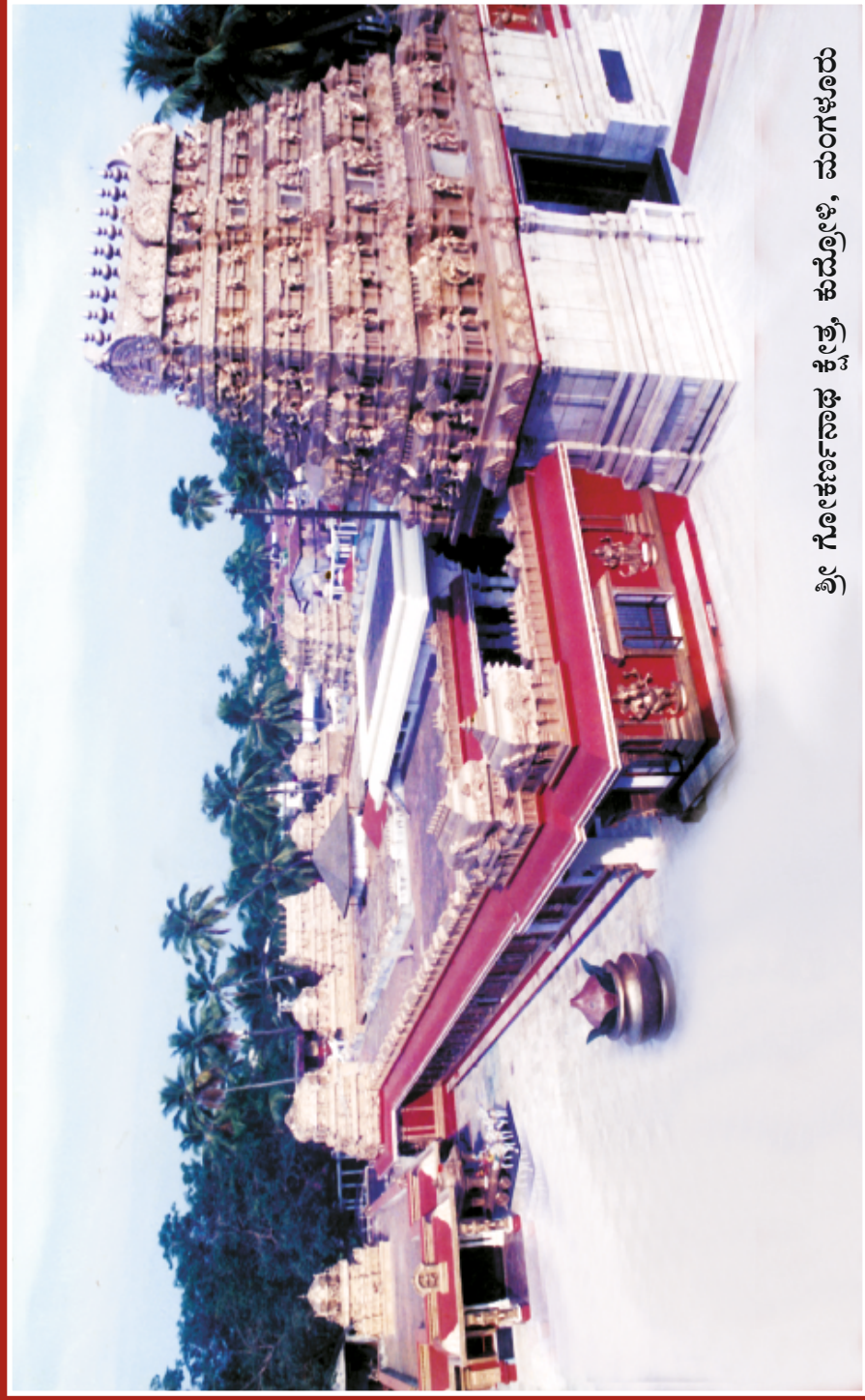
ಶ್ರೀ ಗೋಕರ್ಣನಾಥ ಕ್ಷೇತ್ರ, ಕುದ್ರೋಳಿ, ಮಂಗಳೂರು