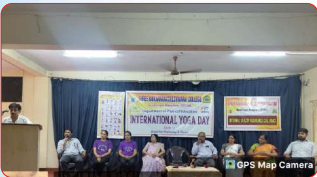
International Yoga Day Celebration