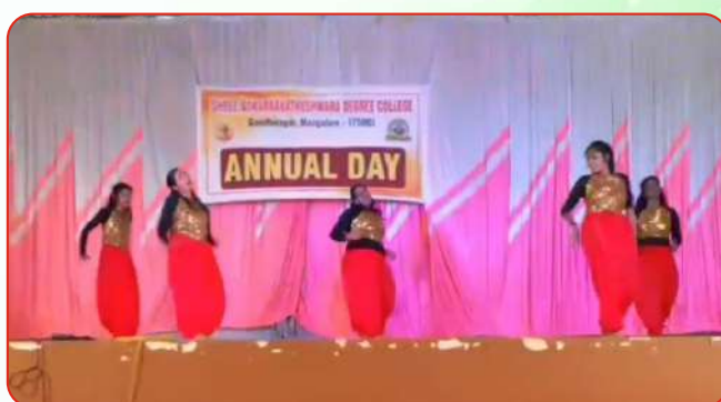
Annual Day Celebration