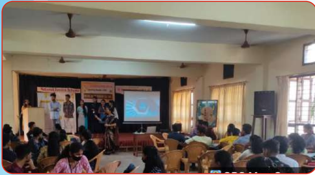
Two days Nxpire Programme