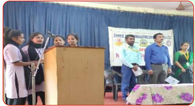
NSS Day Celebration