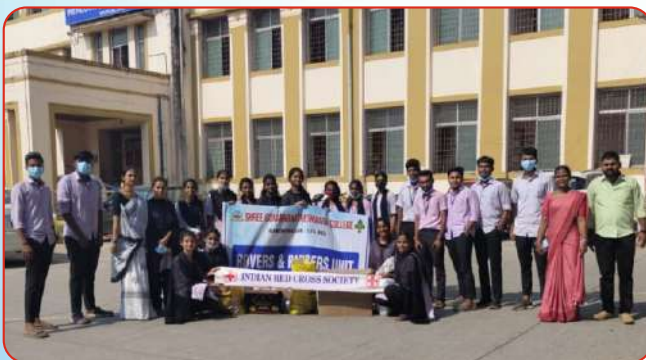
Fruit Distribution to Inpatients of Wenlock Hospital