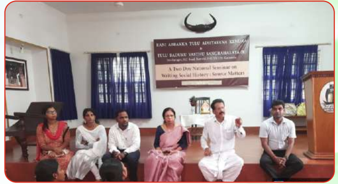
Visit to Rani Abbakka Tulu Study Centre