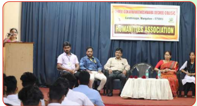
Inauguration of Humanities Association