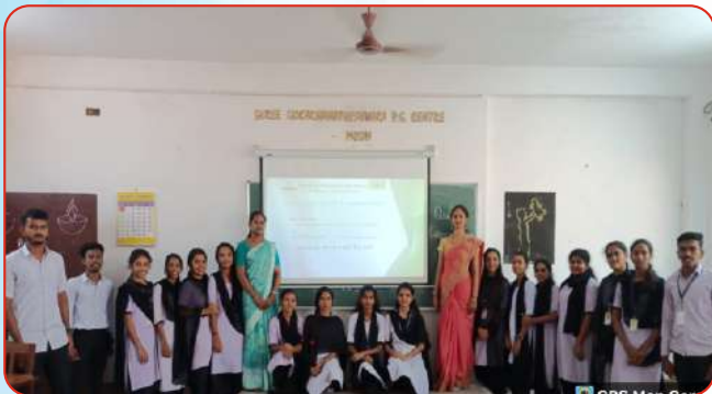
Inter class Quiz Competition