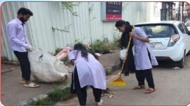
Street Cleaning from Ladyhill to Kudroli Temple on the occasion of Dasara Celebration