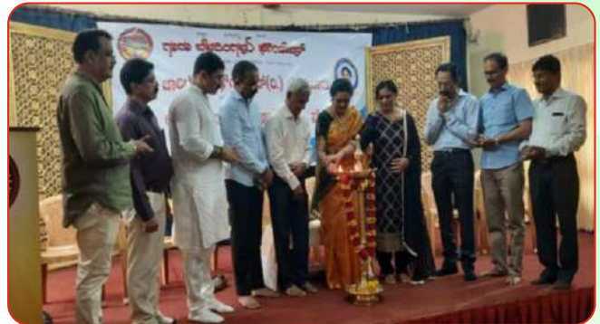
NSS Students Assisted in Health Checkup Camp organised by Guru Beladingalu Foundation, Mangaluru