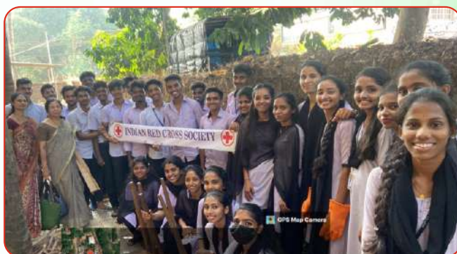
A Guest Talk on "Plant A Tree and Plant A Hope for Future"