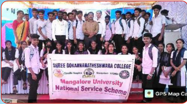
National Youth Day