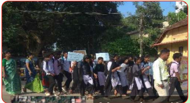
Awareness Campaign on Election