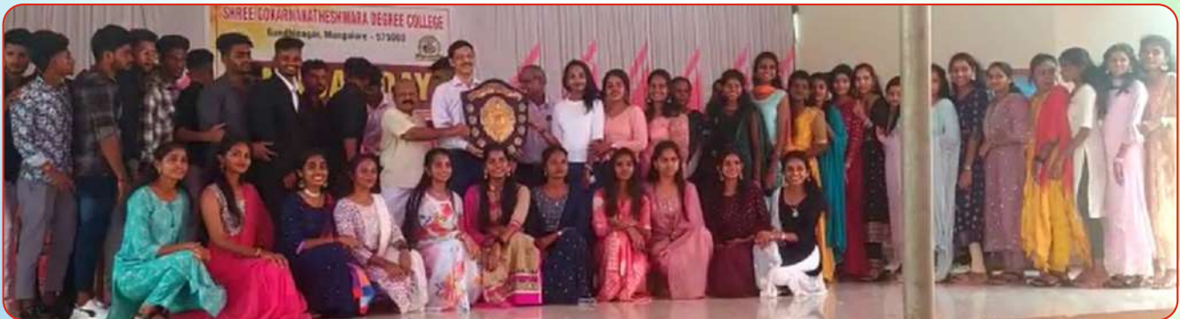
Overall Champion Ship Behind every champion is a team that prepared him to become that champion.