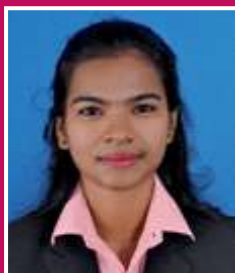
CHESHMA 5 th Rank