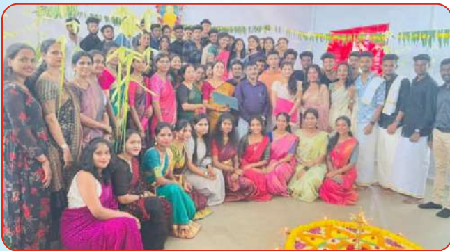
Traditional Day Celebration

"A love for tradition has never weakened a nation, indeed it has strengthened nations in their hour of peril."