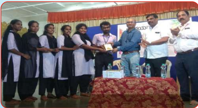
Assistance in Drawing Competition organised by Udayavani daily in Canara Urwa School