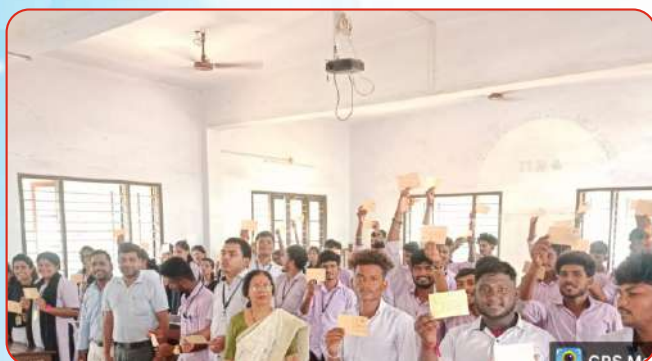
Post Card Abhiyana