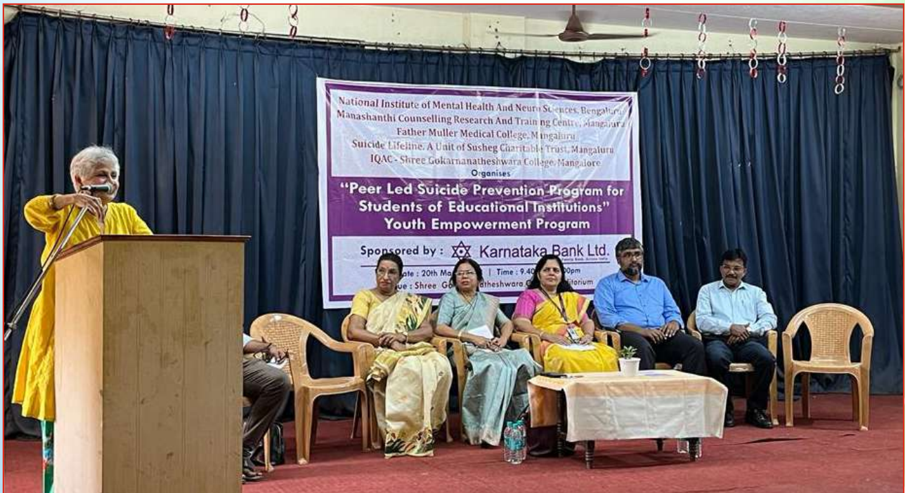
Workshop on Peer led Suicide Prevention Programme, organized in association with NIMHANS, Bangalore & Manashanthi Conuselling Research & Training Centre, Fr. Muller Medical College