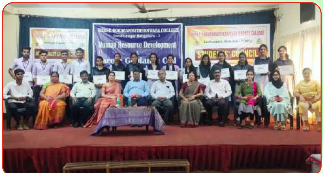
Certificate Course on Competitive Examination by Shlagya institution