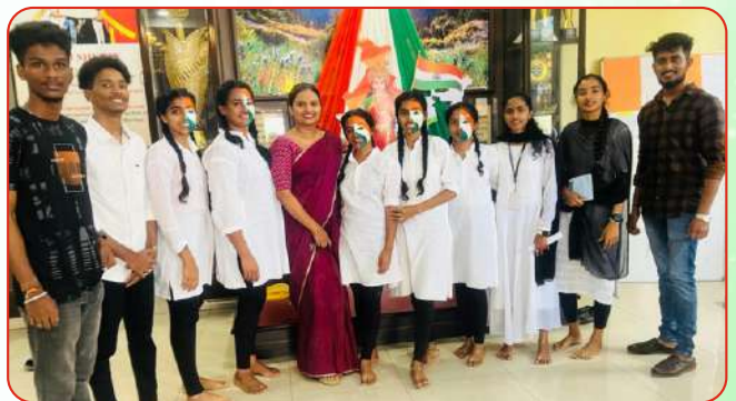
Participation in Cultural Fest 'Azadi ka Amrit Mahotsav'