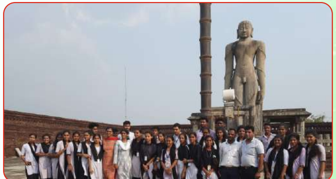
Visit to Historical Place