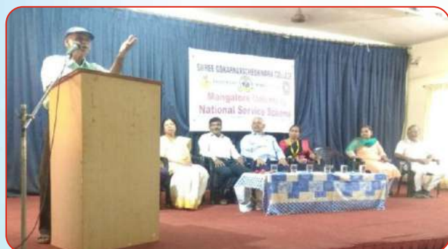
A Guest Talk on "Plant A Tree and Plant A Hope for Future"