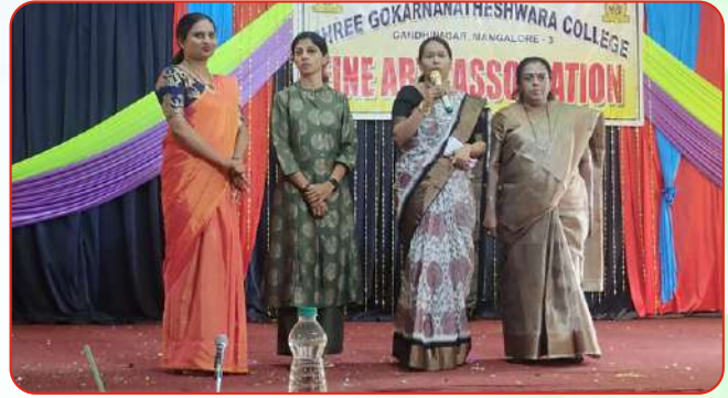
Fine Arts Association Judges Voice