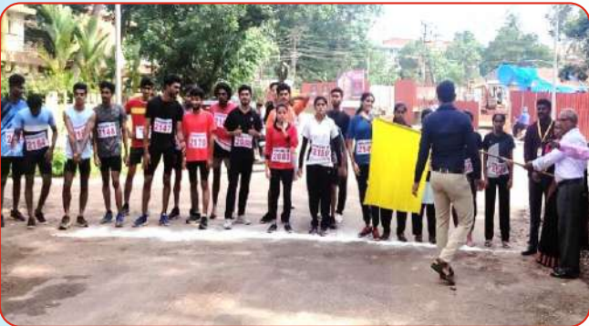
Inter Collegiate Freedom Run and Patriotic Song competition on the occasion of Azadi Ka Amruth Mahotsav