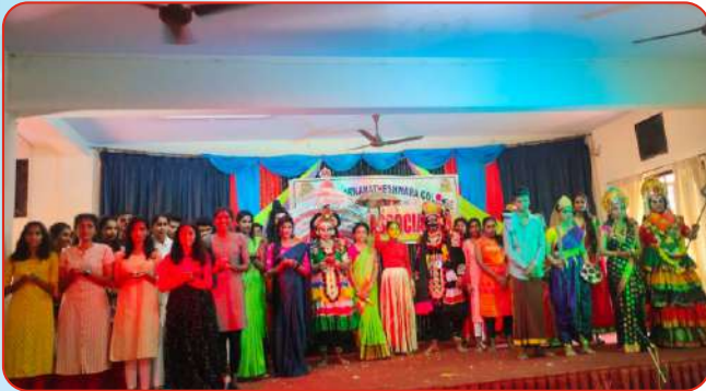
Talents Day Celebration